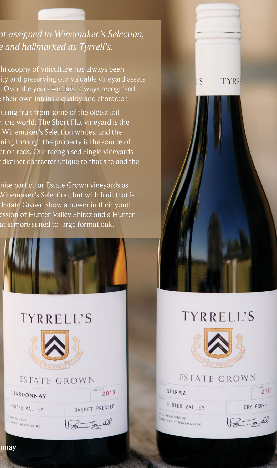
Estate Grown Chardonnay

Tyrrell's further recognise particular Estate Grown vineyards as having the quality of Winemaker's Selection, but with fruit that is not of a style that fits. Estate Grown show a power in their youth that has a bigger expression of Hunter Valley Shiraz and a Hunter Valley Chardonnay that is more suited to large format oak.